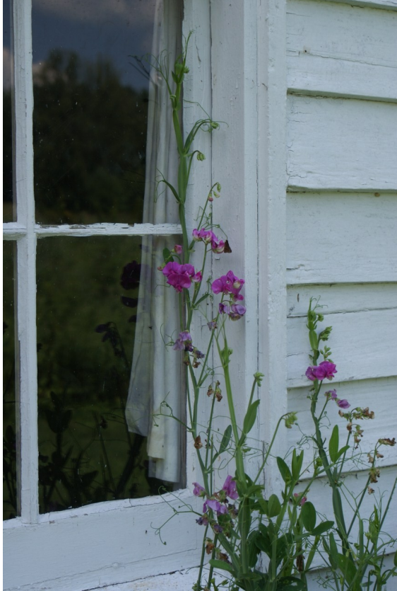
“Outside the Window” - Sharon Garidel