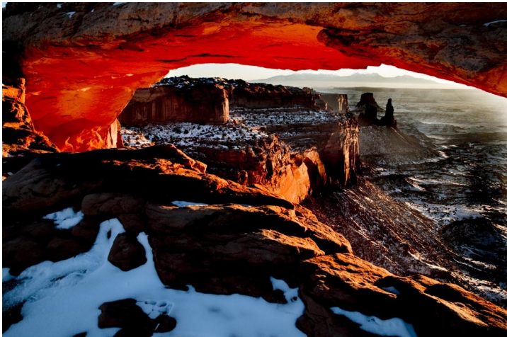
“Natural Window 2” - Bernard Gillette”