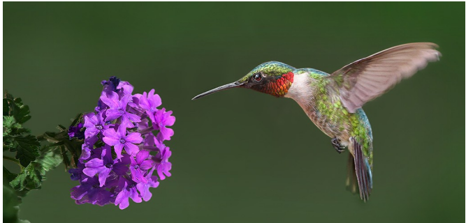
“Out the Office Window” - Kathy Reeves