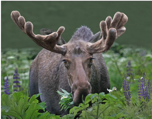
“Through the Car Window” - Kathy Reeves