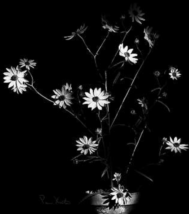
Pin Light Flowers Pam Kaster 2nd Honorable Mention