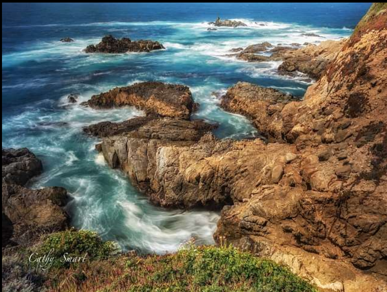
A Rocky Coastline Cathy Smart 2nd Place