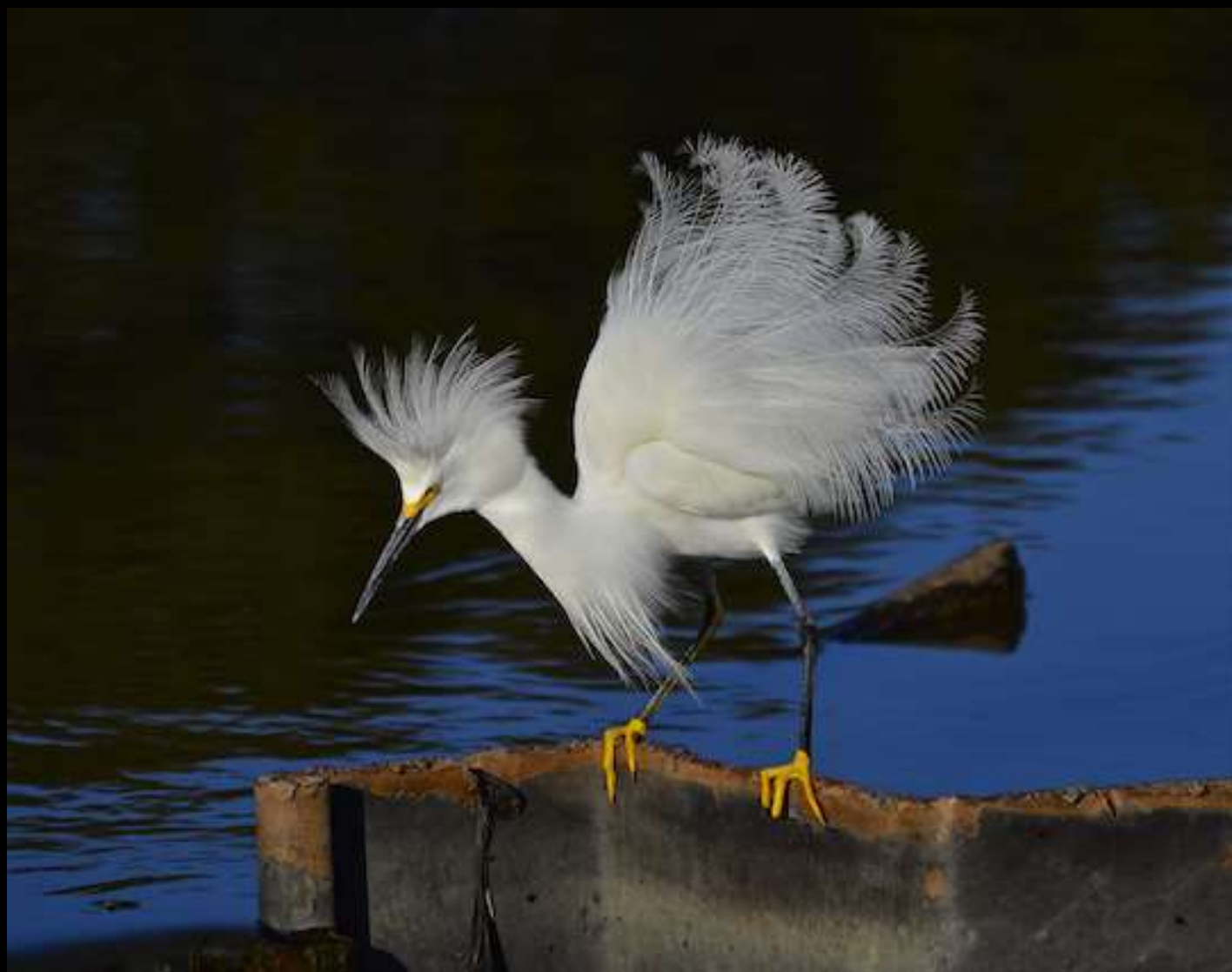
Looking for Lunch Pam Jenkins 2nd Honorable Mention