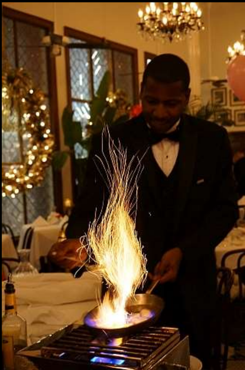
Banana Foster's Flame Kitty Kunhert 2nd Place