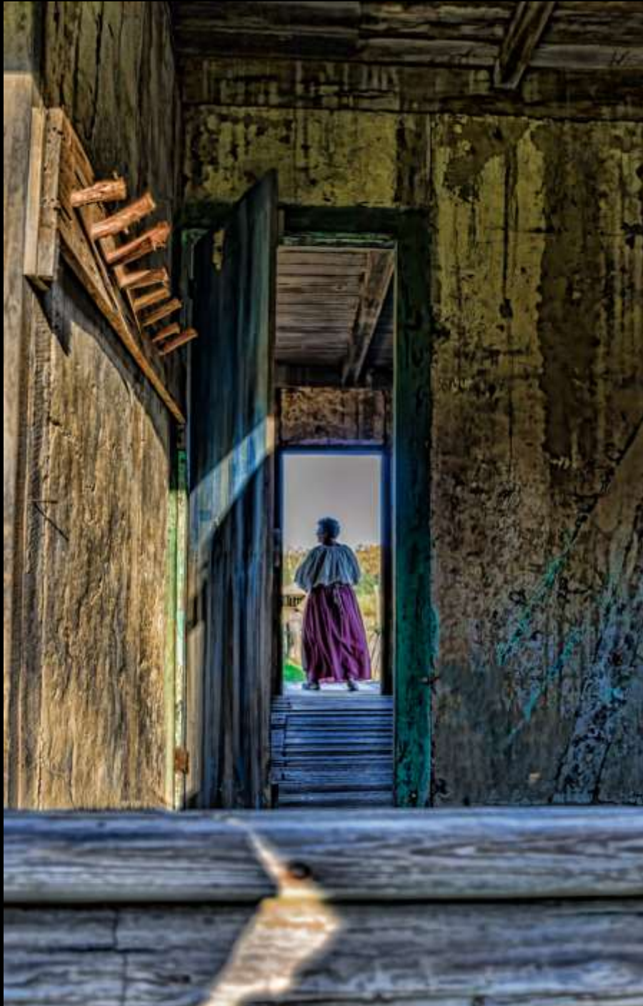
Outside Looking In Lind Michel Honorable Mention