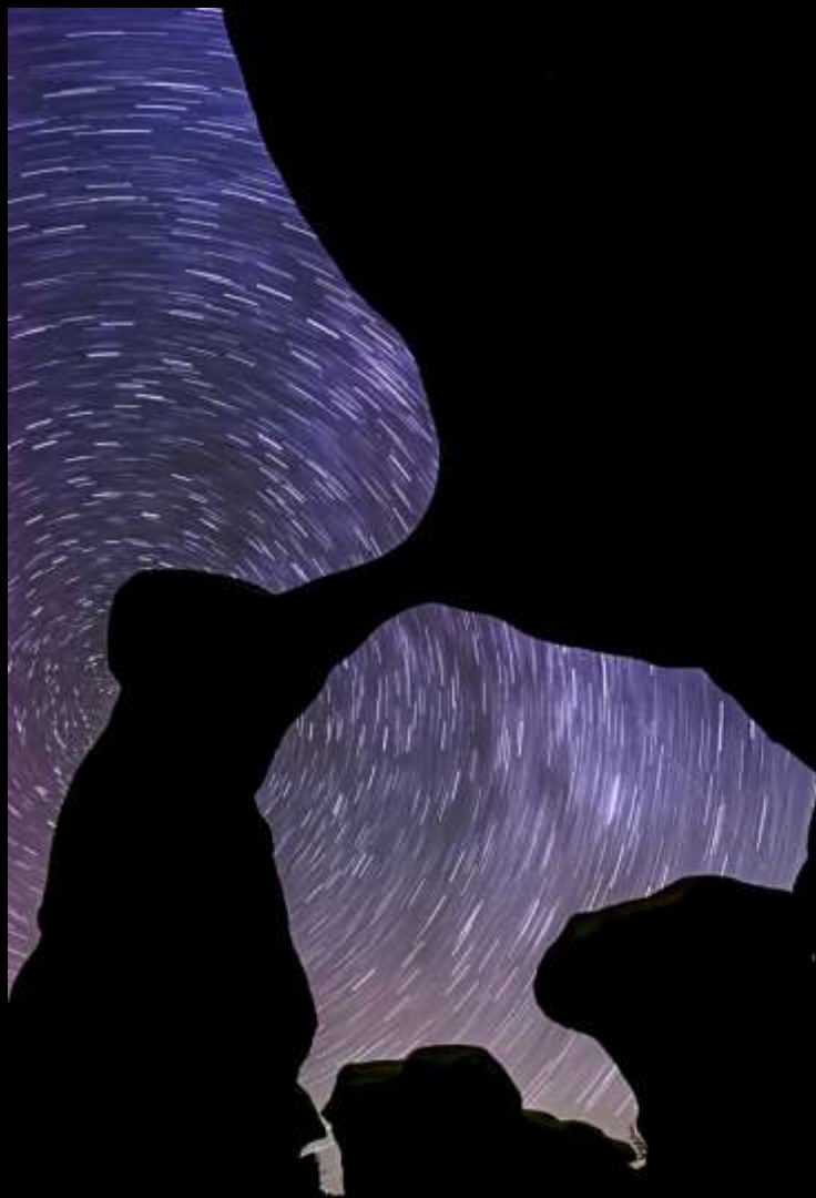
Window to the Stars Cris Garcia 2nd Place