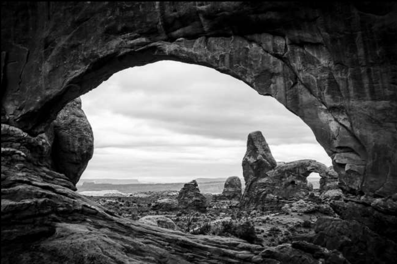
Window to the West Cris Garcia 2nd Place