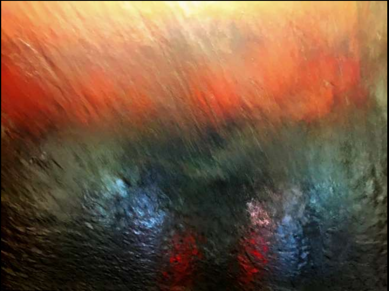
In the Car Wash Cathy Smart Honorable Mention